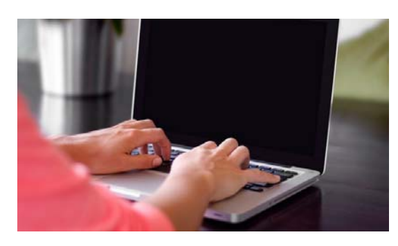
Get a Computer for Your Blind Child

I didn't realize that blind people weren't supposed to do things for a very long time. READ MORE at WonderBaby.org .